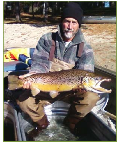
A fat 27.9 inch Seeforellen brown trout sampled at East Twin Lake this week (fish was measured and released).

NORTHERN PIKE fishing is spotty, with good action reported from some coves and behind islands. One pair of anglers bagged 24, 27, 29, 31 and 32 inch pike last week. CARP are being caught, with many 20 lb plus fish coming to creel this past week.